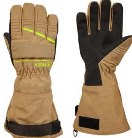
Crystal Long Beige