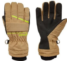
Crystal Evo Beige